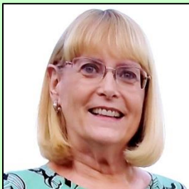
EDITOR Pam Bradford

DEADLINE Submit articles and photos by the 25th of each month to Pam at: pambradford@pamsemail.net