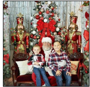
Amy McKenzie posted: "Naughty or nice?"