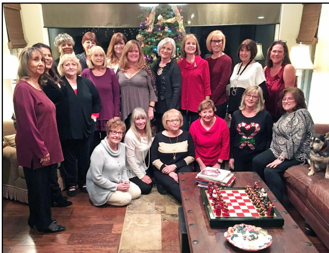
SI RIVERSIDE GROUP PHOTO AT OUR HOLIDAY PARTY IN DECEMBER