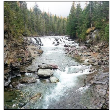
Annamarie Megrdichian updated her cover photo.