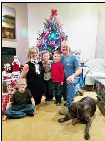
Janet Payton posted a photo.